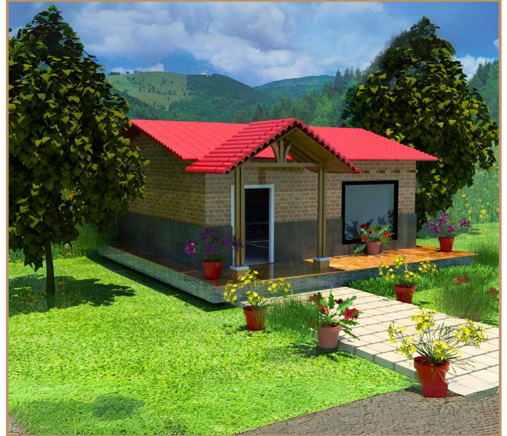
INTERIOR & EXTERIOR